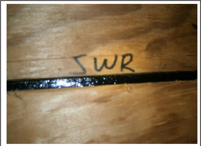
SECONDARY WATER RESISTANCE – A polymer adhesive “peel & stick” SWR Barrier was installed on the entire roof deck in 2016