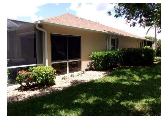
SIDE ELEVATION VIEW

The Villas I at Heritage Cove Association, Inc. 9794, 9800, 9806, 9812, 9818 & 9824 Avery Point Lane, Fort Myers, FL 33919 07-05-2017