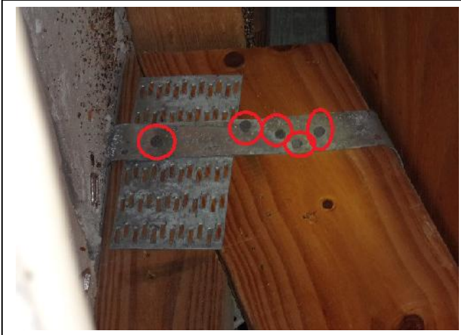
ROOF TO WALL ATTACHMENT – Properly installed Single Wraps

R3 of Florida, LLC P.O. Box 152205 Cape Coral, FL 33915 Office: 239.810.7793 Email: radjrsas@yahoo.com