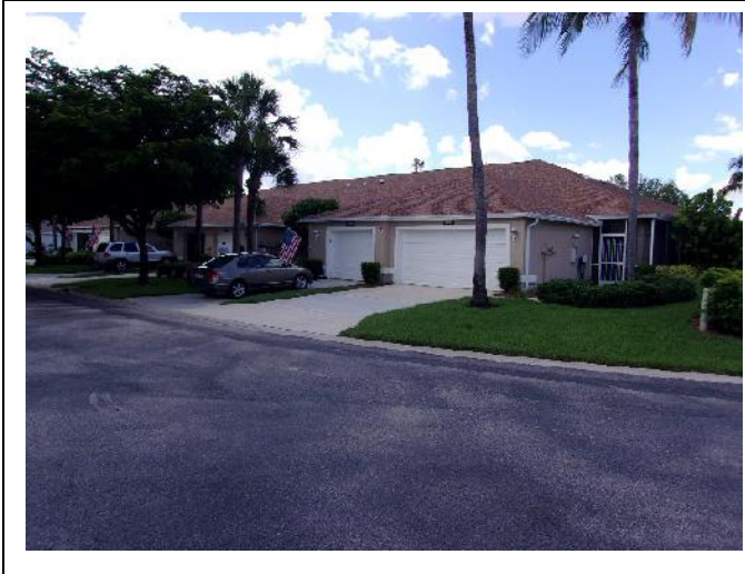
FRONT ELEVATION VIEW

R3 of Florida, LLC P.O. Box 152205 Cape Coral, FL 33915 Office: 239.810.7793 Email: radjrsas@yahoo.com