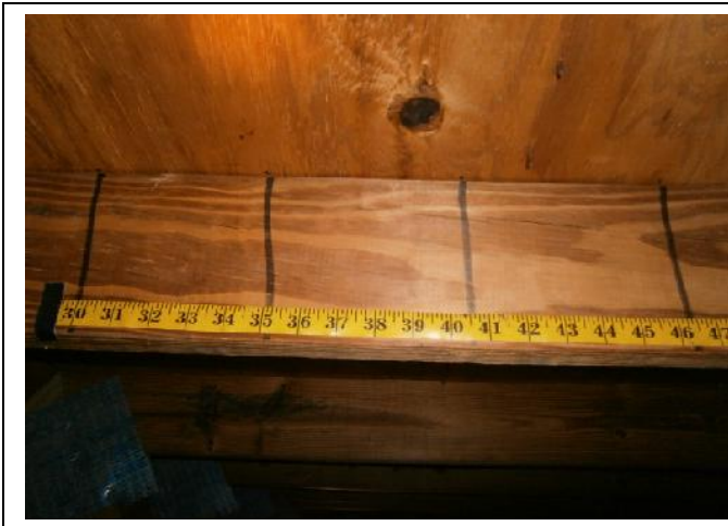
ROOF DECK ATTACHMENT – 8d nails within 6 inches along the edge