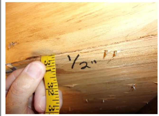
ROOF DECK THICKNESS – ½ inch plywood

R3 of Florida, LLC P.O. Box 152205 Cape Coral, FL 33915 Office: 239.810.7793 Email: radjrsas@yahoo.com