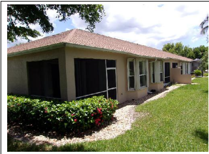
REAR ELEVATION VIEW