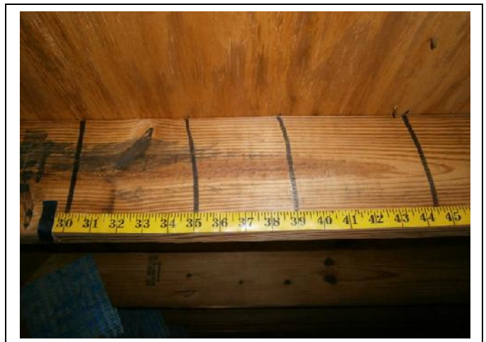
ROOF DECK ATTACHMENT – 8d nails within 6 inches in the field

The Villas I at Heritage Cove Association, Inc. 9794, 9800, 9806, 9812, 9818 & 9824 Avery Point Lane, Fort Myers, FL 33919 07-05-2017