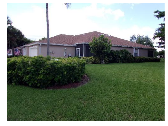
SIDE ELEVATION VIEW