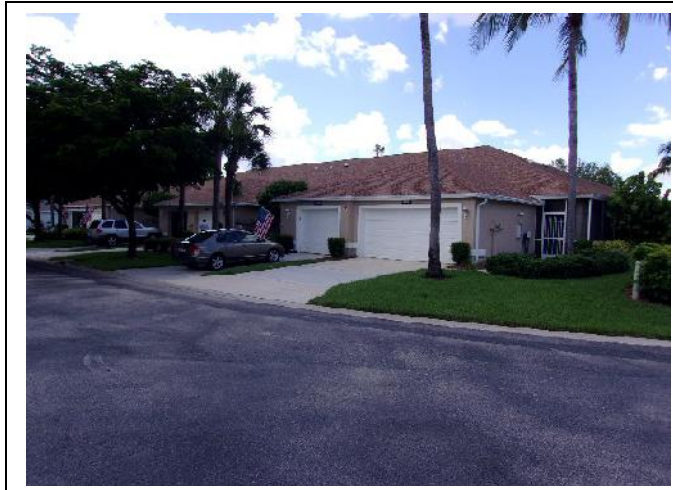
ROOF GEOMETRY – Hip Roof Shape