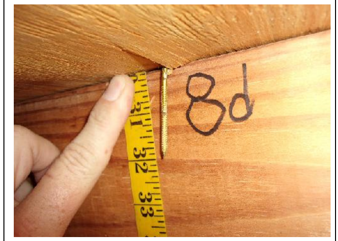
ROOF DECK ATTACHMENT – 8d ring shank nails added in 2016