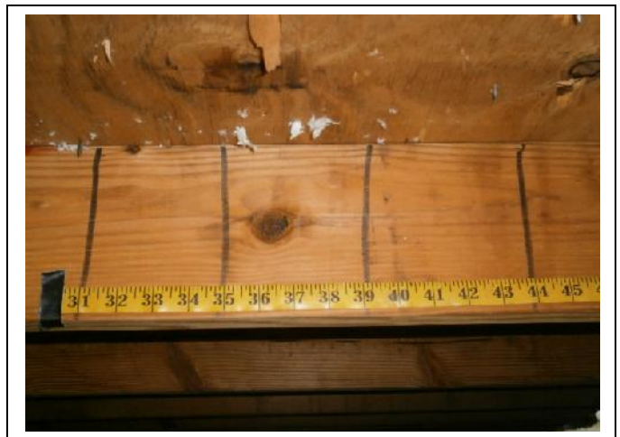
ROOF DECK ATTACHMENT – 8d nails within 6 inches in the field

The Villas I at Heritage Cove Association, Inc. 14081, 14087, 14093, 14099, 14105 & 14111 Mystic Seaport Way, Fort Myers, FL 33919 07-05-2017