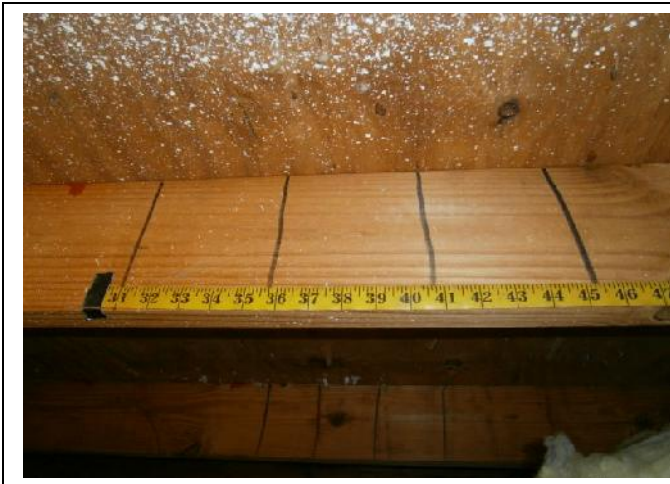
ROOF DECK ATTACHMENT – 8d nails within 6 inches along the edge