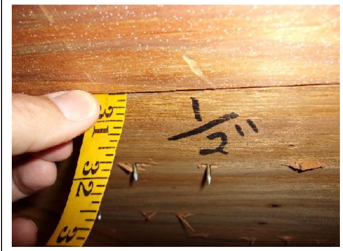
ROOF DECK THICKNESS – ½ inch plywood

R3 of Florida, LLC P.O. Box 152205 Cape Coral, FL 33915 Office: 239.810.7793 Email: radjrsas@yahoo.com