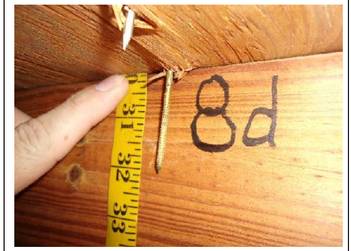
ROOF DECK ATTACHMENT – 8d ring shank nails added in 2016