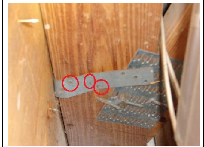
ROOF TO WALL ATTACHMENT – Properly installed Single Wraps