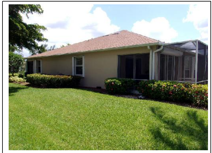
SIDE ELEVATION VIEW

The Villas I at Heritage Cove Association, Inc. 14045, 14051, 14057, 14063, 14069 & 14075 Mystic Seaport Way, Fort Myers, FL 33919 07-05-2017