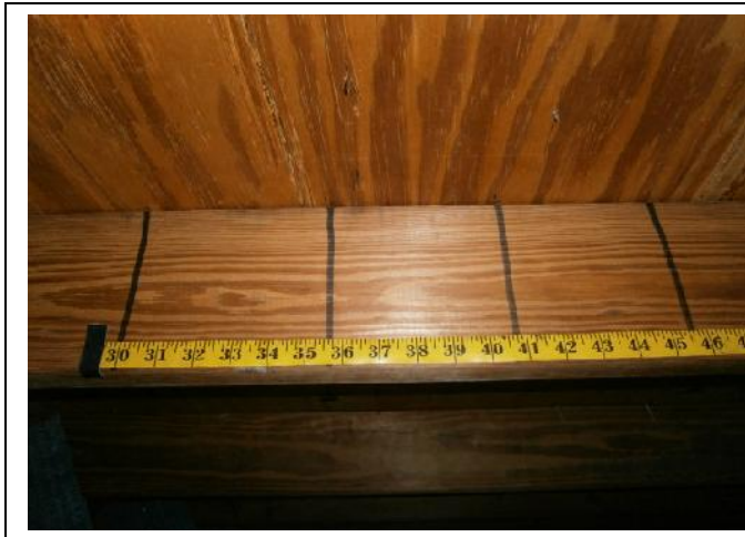
ROOF DECK ATTACHMENT – 8d nails within 6 inches along the edge