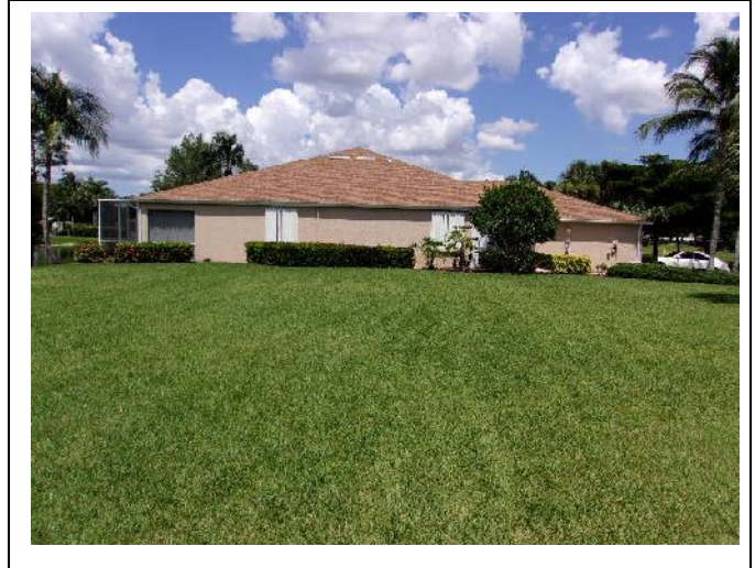
SIDE ELEVATION VIEW