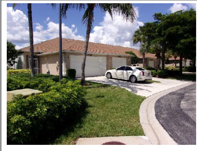
FRONT ELEVATION VIEW

R3 of Florida, LLC P.O. Box 152205 Cape Coral, FL 33915 Office: 239.810.7793 Email: radjrsas@yahoo.com