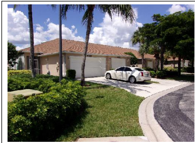
ROOF GEOMETRY – Hip Roof Shape