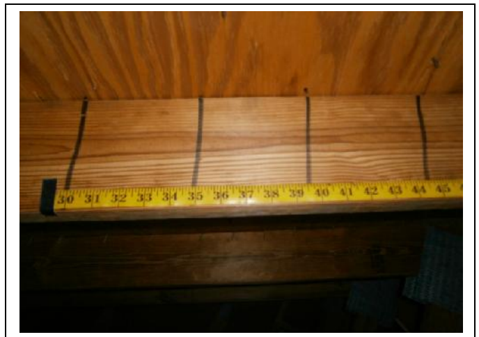
ROOF DECK ATTACHMENT – 8d nails within 6 inches in the field