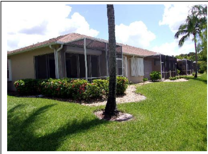
REAR ELEVATION VIEW