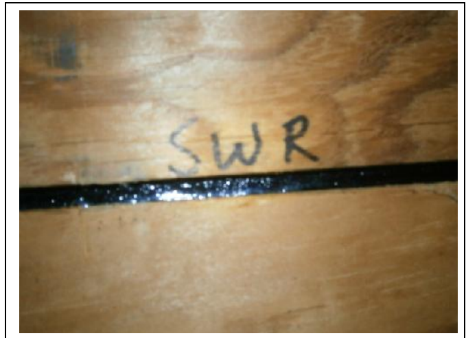
SECONDARY WATER RESISTANCE – A polymer adhesive “peel & stick” SWR Barrier was installed on the entire roof deck in 2016